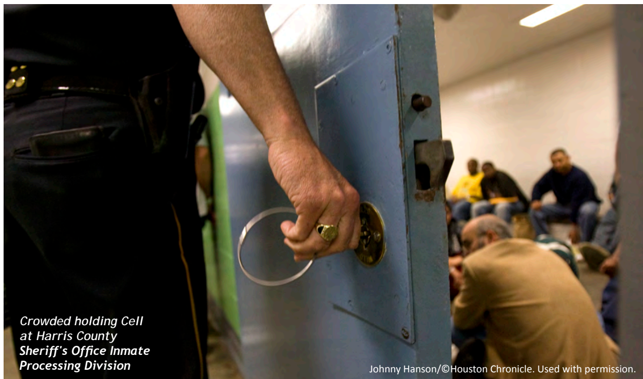
Crowded holding Cell at Harris County Sheriff's Office Inmate Processing Division

Despite being home to the largest jail in Texas (and third largest in the United States), Harris County has nonetheless struggled with jail overcrowding for the past four decades. In 1974, a group of inmates filed a lawsuit against the Sheriff and County Commissioners that challenged the conditions of their confinement; it culminated in a federal court order condemning the overcrowded conditions in the Harris County jail, and it provided jurisdiction to the federal court to ensure steps were taken to bring the conditions of the jail within constitutionally protected standards. 3 For nearly two decades, that court wielded its oversight power heavily, frequently intervening to prevent conditions at the Harris County jail from deteriorating further. And yet, following the termination of the court's oversight in the mid-1990's, the Harris County jail population once again swelled.