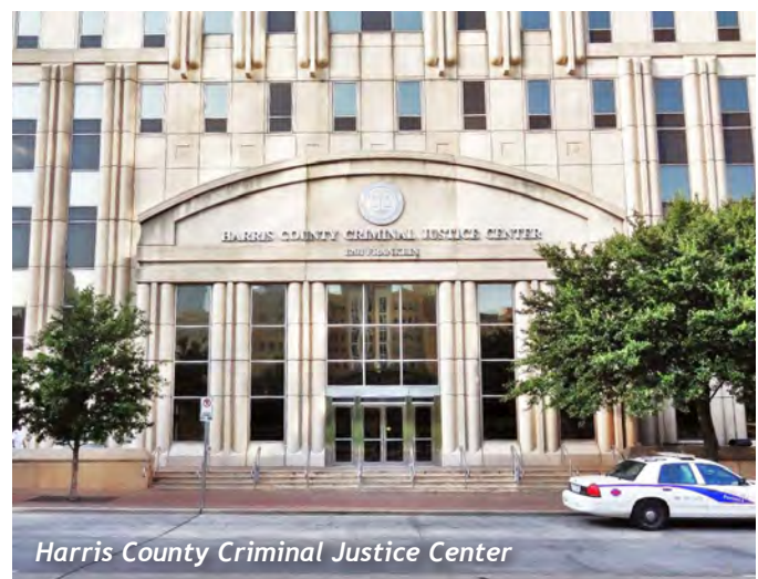
Harris County Criminal Justice Center

This lack of a cohesive, county-wide data system is inefficient and impedes timely, well-informed decision-making.