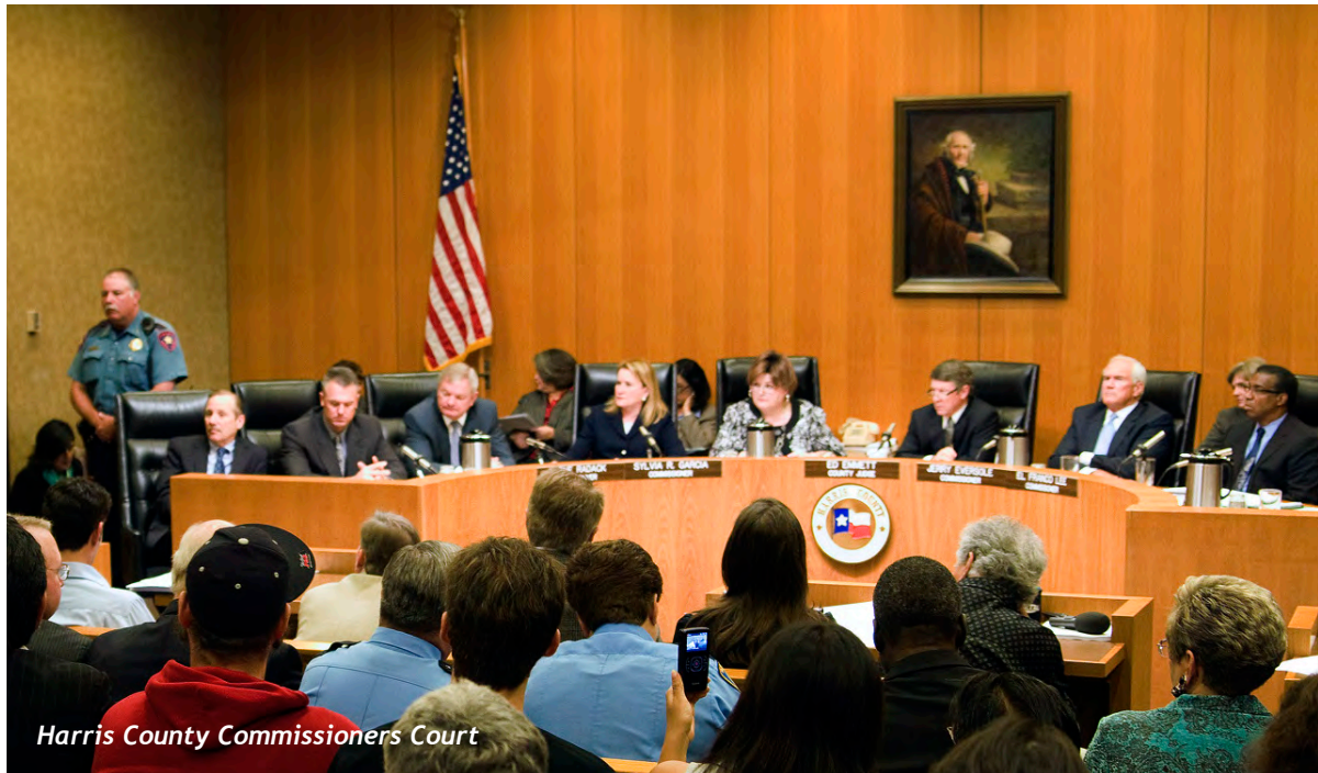
Harris County Commissioners Court

At minimum, the HCCJCC should add the following five agencies or representatives to its membership: