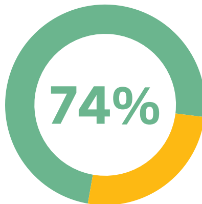
74% of people on EM in Cook County are Black

It is impossible to effectively discuss any part of the American criminal legal system without engaging with its history, which is steeped in racial oppression. EM came into use at the height of the “war on drugs,” a racially motivated set of policies that vastly disproportionately affected Black and other people of color. 15 In the one jurisdiction that was able to provide data on the race of people subject to EM (Cook County), we found that EM had the same disproportionate racial demographics as the pretrial jail population; 74% of people on EM in Cook County are Black, approximately