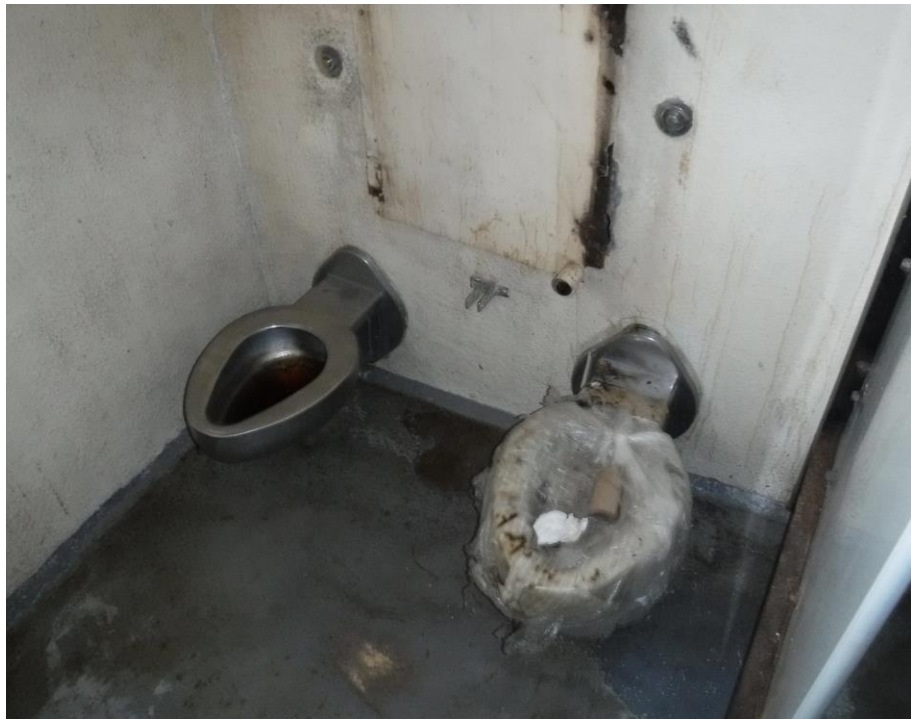
An inaccessible, inoperable toilet in MSP.

In Building 42 , known as “the hospital,” there are four zones. At the hospital, all offenders are undergoing treatment for various disabilities, injuries, and/or illnesses. Therefore, one would suspect that accessible bathrooms would be present in single cells, but surprisingly, they were not. We found standard hospital cells and isolation rooms; however, none of the commodes in the offender’s room had hand rails. For each zone, there was only one bathroom at the entrance of the hall that was designated as accessible. This is unacceptable and does not suffice because an offender needing an accessible bathroom must leave his hospital room and walk all the way to the end of the hall to relieve himself. In addition, because there is only one accessible bathroom, the offender, more than likely, will have to wait. The hospital can hold up to 44 offenders on each zone.