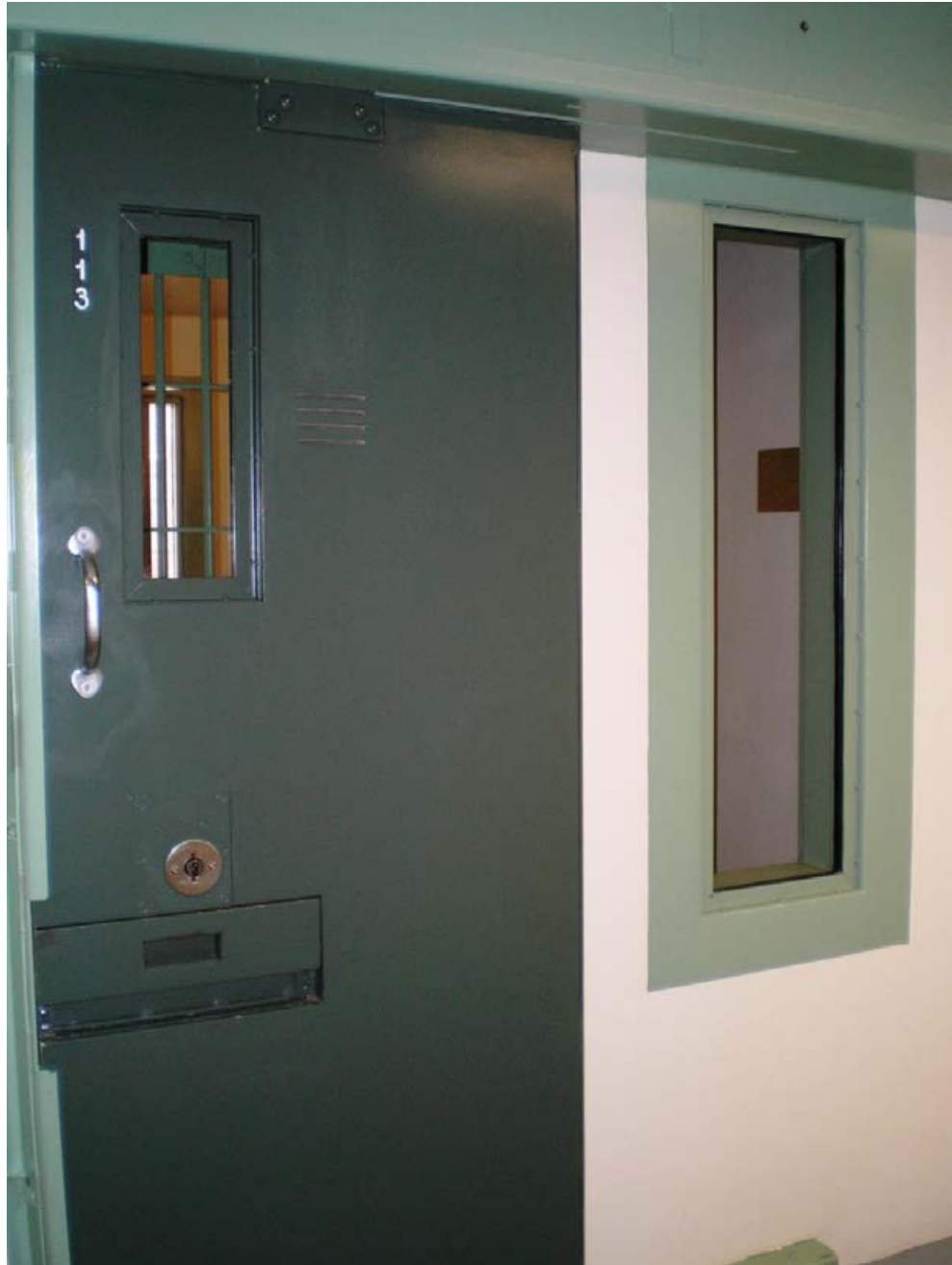
Outer door of a cell in the Control Unit at ADX, picture take from the corridor

A stipulated court agreement in 2008 provided that an Imam visit ADX four times a month to speak with inmates individually. Prison attorneys have reported that since there is no longer an Imam on site, inmates in the past few years have received far fewer visits from an Imam than the limit set in the court agreement. 33