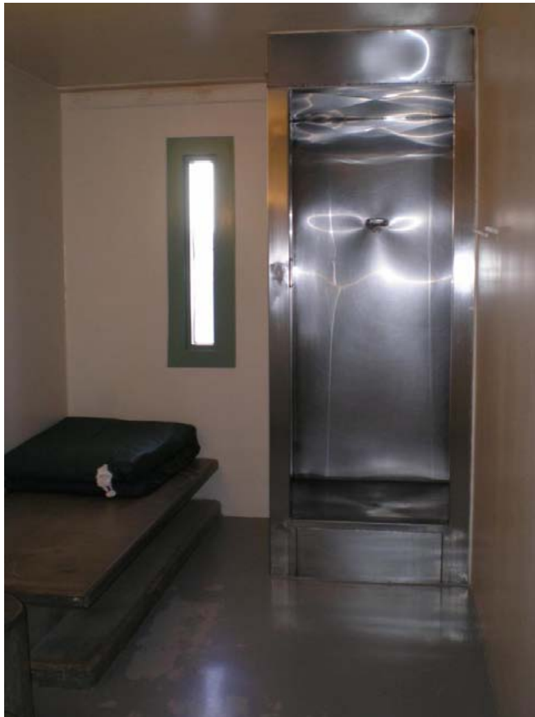
An isolation cell in a General Population Unit at United States Penitentiary, Administrative Maximum (ADX)