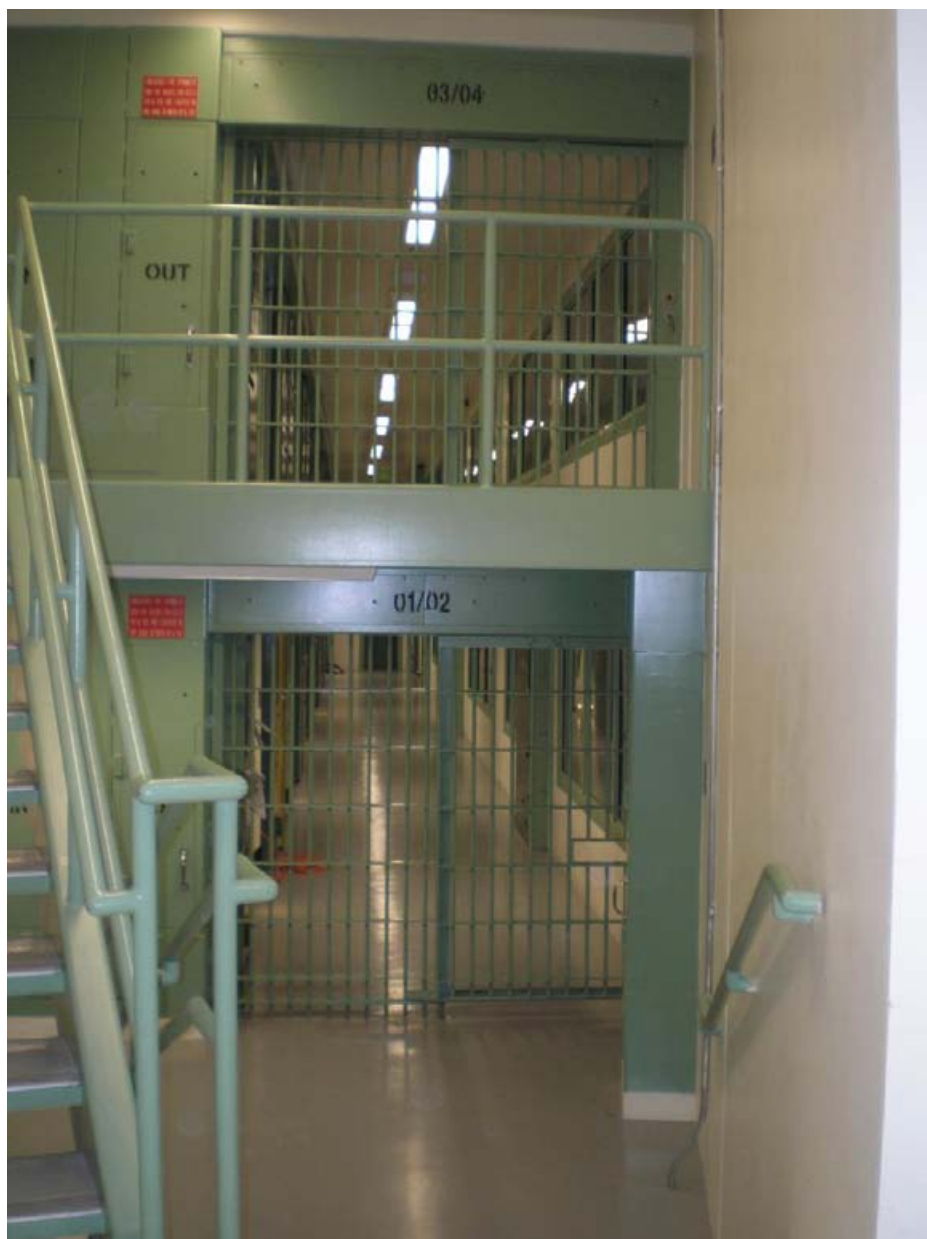
The SHU range in ADX

The Control Unit (CU), together with the SHU and Range 13, are the most isolated units in ADX as prisoners recreate alone and have no contact with anyone other than staff. Prisoners are assigned to the CU for fixed terms for serious offences, usually committed in other prisons, after a hearing which is similar to a disciplinary hearing. The fixed terms can be as long as six years or more, 68 and may be extended if further offences are committed while the prisoner is in the Unit.