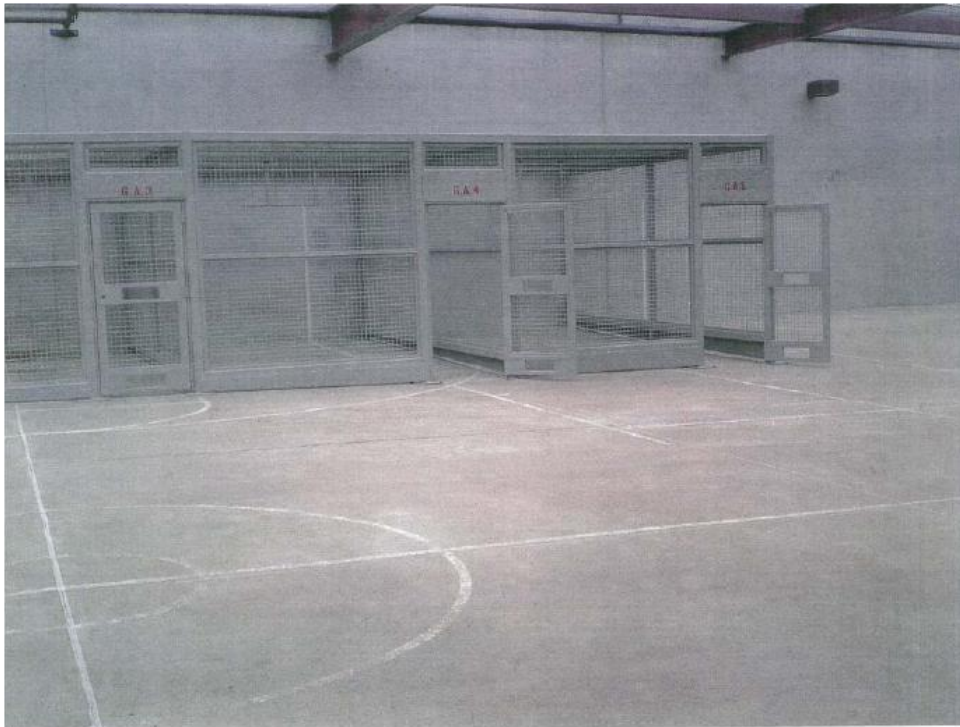
Outdoor recreation cages at ADX

group interaction. As described below, prisoners in the step-down program also have significantly less association and out of cell time than previously. According to a lawsuit, more could be done to ensure the safety of prisoners in group recreation. 32