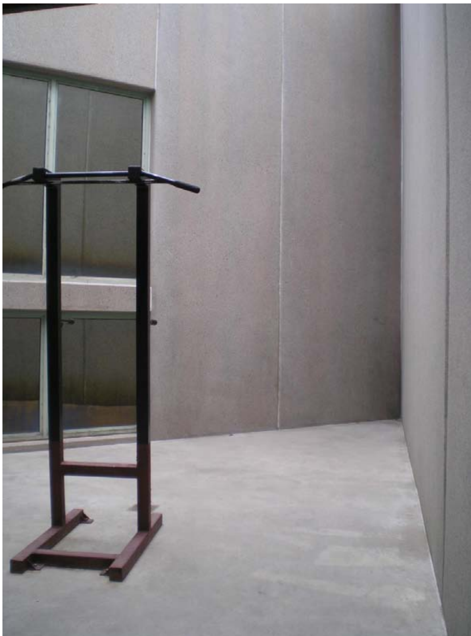
An outdoor recreation area in the Control Unit at ADX

According to BOP regulations, prisoners may have their exercise in the larger yards suspended for three months at a time for a single rule violation, with increased suspensions for further offences. 27 It is alleged that prisoners are sometimes punished for minor rule violations, such as in one case for feeding crumbs to birds. 28 The regulations list violations for which the yard exercise can be suspended as including “sexual acts or gestures, suicidal attempts or gestures, smearing or throwing human waste”. 29 Amnesty International is concerned that prisoners who have not committed serious violations, or whose behaviour may be indicative of mental health or behavioural problems, should have their outdoor yard exercise -- and thus their only limited association with other inmates -- withdrawn for such extended periods. It urges that this rule be reviewed.