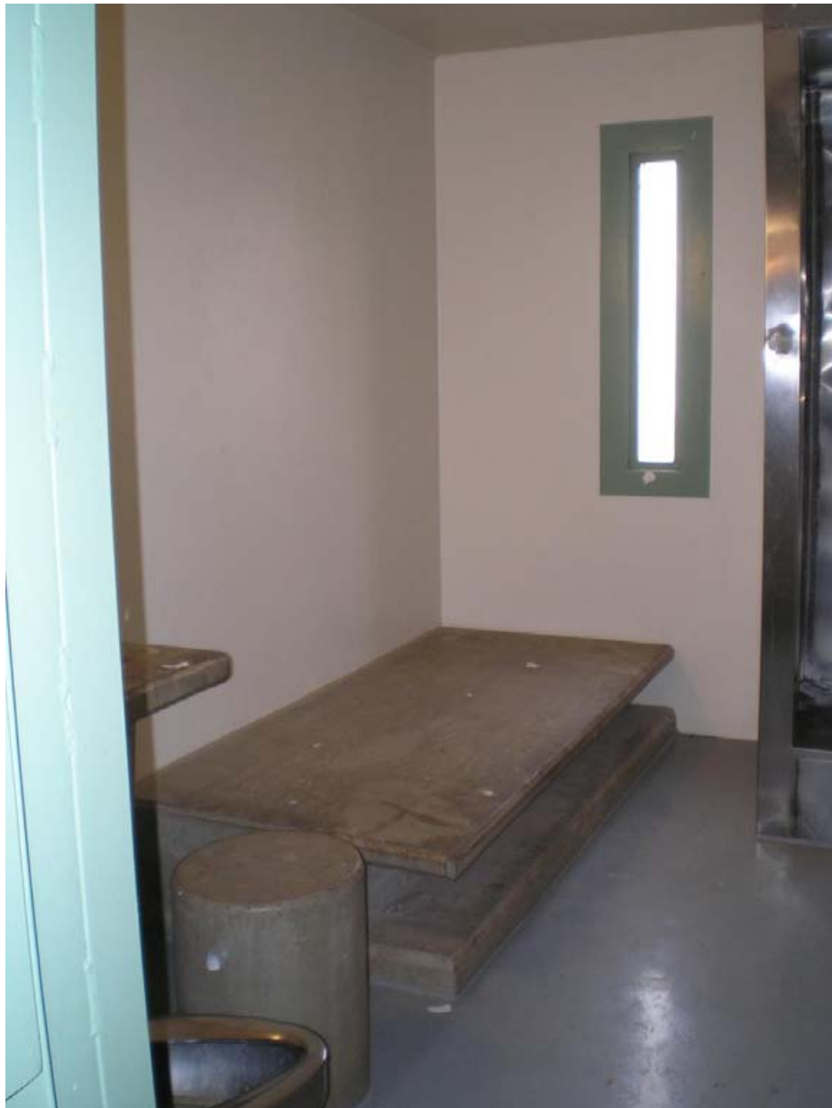
Interior of a SHU cell at ADX

Prisoners in the CU have no access to the SDP but they can receive monthly credits for positive behaviour which can reduce their terms; they may also lose credit for disciplinary offences or failure to adjust. ADX regulations require that all prisoners receive monthly reviews by a CU Team attended by a psychologist. An Executive Panel reviews each CU case every 60-90 days to determine an inmate's readiness for release (to another prison or to the ADX GP). 69