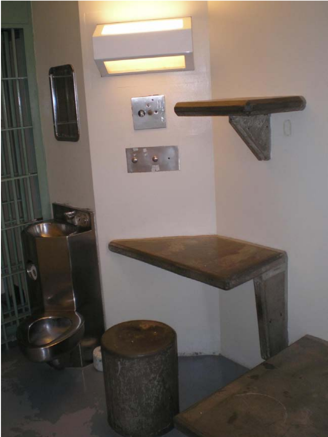
The inside of a cell in a General Population Unit at ADX

The vast majority of prisoners are allowed out of their cells for only a few hours a week, for exercise, occasional visits to a “law library” cell, social or legal visits, or for some medical consultations. 26 All meals are delivered to and eaten inside the cells. As Amnesty International has observed elsewhere, there is concern about the possible health risks from spending so much time in a confined space, and eating all meals in close proximity to the open toilet. Prisoners are placed in full restraints and are accompanied by two guards when being escorted out of their cells. Otherwise nearly all contact with staff takes place either remotely (e.g. through medical teleconferencing) or at the cell front.