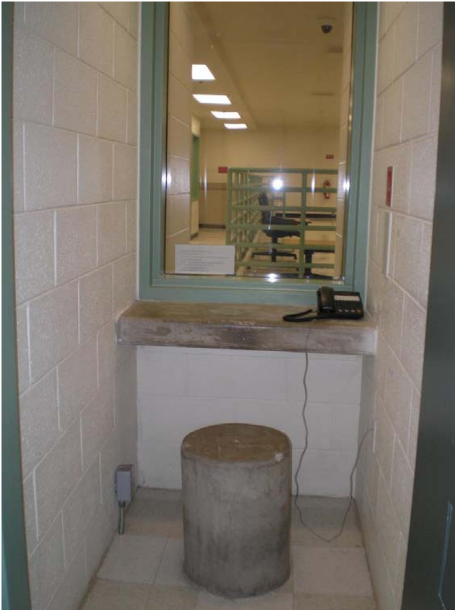
The inmate side of the social visits compartment

Amnesty International believes the degree of restraint applied routinely during non-contact visits appear to be unnecessarily punitive, especially for prisoners who do not have a history of serious rule violations or acts of institutional violence within the facility, and for prisoners needing to communicate with attorneys. International standards provide that restraints should be applied only when “strictly necessary” as a precaution against escape or to prevent damage or injury. 40