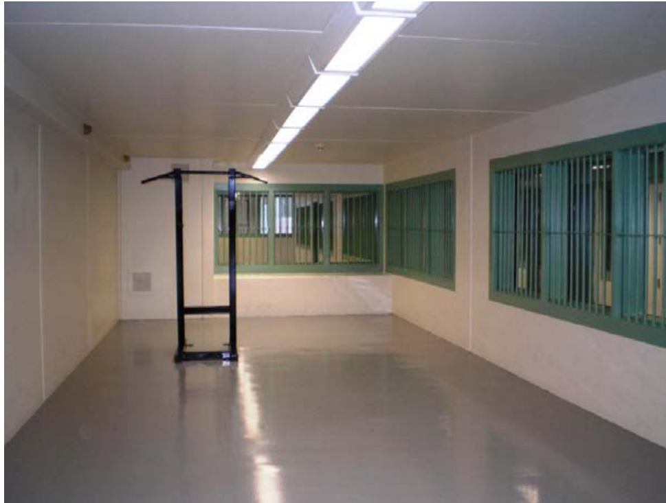
Indoor recreation area in the Control Unit at ADX

The opportunity to exercise is particularly important for the physical and psychological wellbeing of prisoners who are cut off from normal activities and are confined to cells for prolonged periods. Neither the cages nor the enclosed individual yards in Amnesty International’s view meet the standard of “suitable exercise in the open air” as provided under the SMR, nor, under the present regime at ADX, is outdoor exercise provided to each prisoner daily.