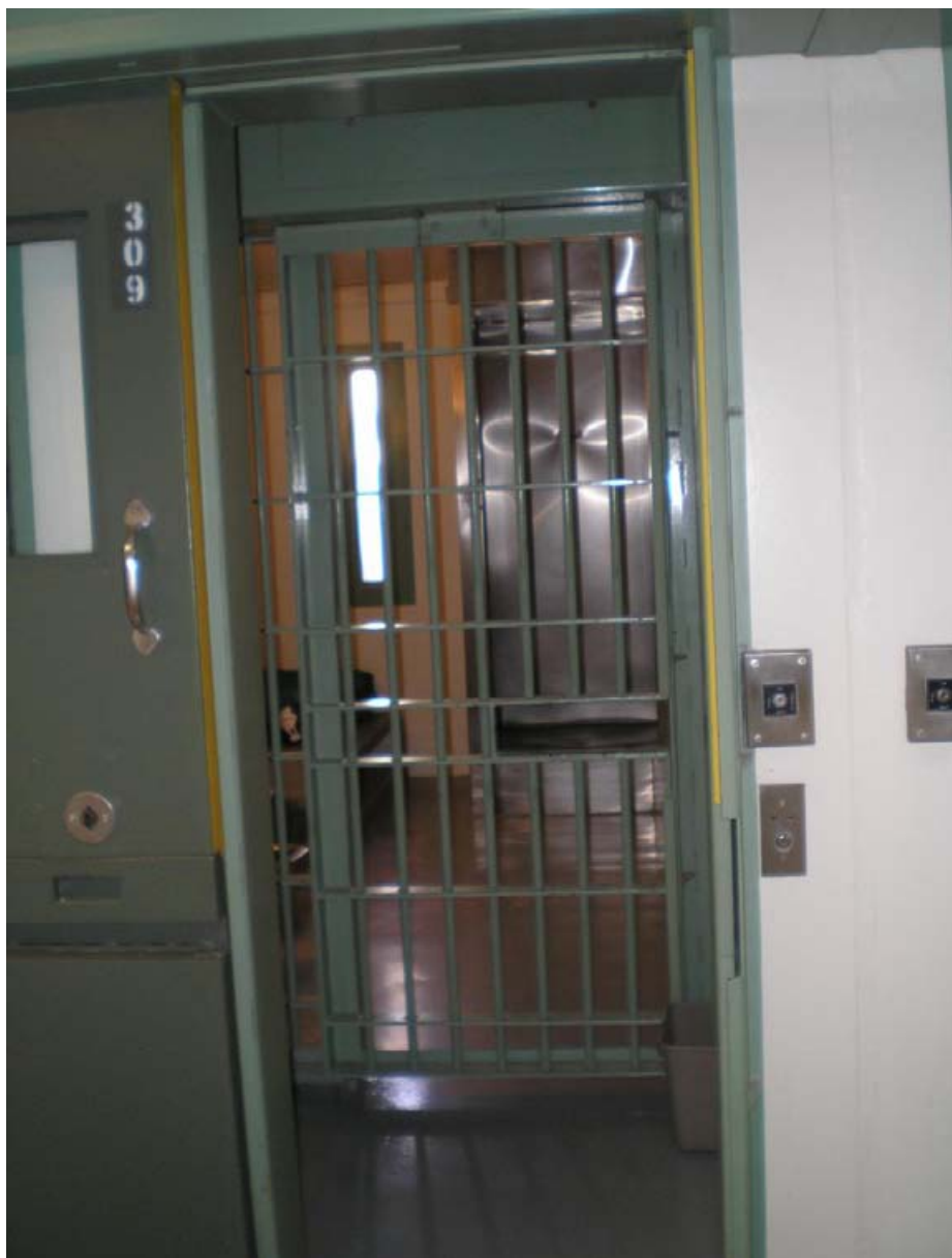
Inner door of a General Population cell at ADX, picture taken from the corridor

While Amnesty International's delegate recognized that there were a number of in-cell programs available at the time of her 2001 visit, these cannot compensate for the prolonged cellular confinement and social isolation experienced by ADX prisoners for many months or years, or even indefinitely. The value of in-cell programs becomes more questionable the longer a prisoner is held in isolation and unable to interact meaningfully with others. Prisoner advocates have also reported that, apart from some basic educational courses such as GED (which are required by a minority of inmates), there is not much structured educational or rehabilitative programming leading to formal qualifications or defined outcomes or goals. 35