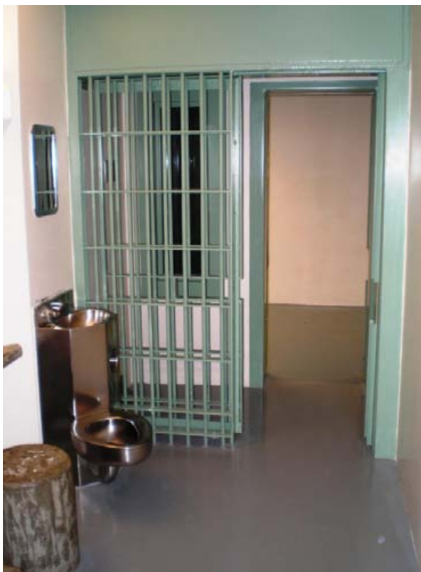
Inside of a cell in the Control unit at ADX

The TU and the Pre-Transfer Unit were both originally sited at the ADX facility but are now located at USP Florence, a high security prison which, like ADX, forms part of the Federal Correctional Complex (FCC) at Florence. ADX itself has therefore become almost entirely a "lock-down" facility in which prisoners are locked in solitary cells for all but a few hours a week. Amnesty International is concerned that, at a time when there is growing recognition of the damaging effects of isolation and moves to restrict such practice in some states, conditions in ADX have become more restrictive in recent years.