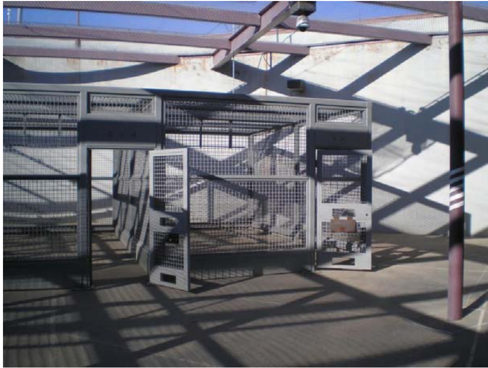
An outdoor recreation cage for prisoners in the Step Down Program at ADX

GP prisoners are allowed up to ten hours out-of-cell exercise a week, in two hour slots five days a week, alternating between indoor and outdoor exercise. Prisoners always take indoor exercise alone, in a windowless room with only a pull-up bar. Outdoor exercise takes place either in an enclosed solitary yard attached to the unit or in one of five individual cages in a larger yard. The only time a prisoner can communicate directly with another inmate is when conversing with a prisoner in an adjacent cage, an opportunity which takes place, at most, on two or three days a week.