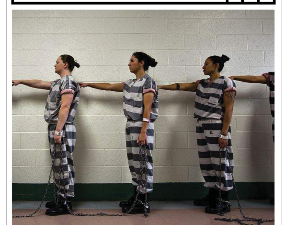
A PROJECT OF THE INCARCERATED WORKERS ORGANIZING COMMITTEE OF THE INDUSTRIAL WORKERS OF THE WORLD