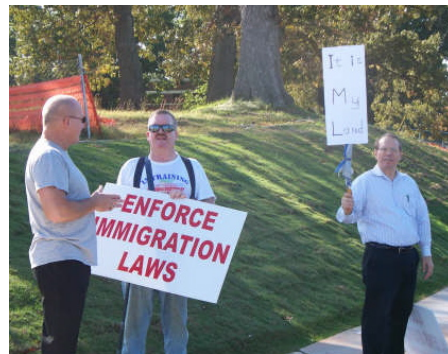
Anti-immigrant activists champion nativist attitudes in Cobb County. The sign held by the man on the right reads: "It is My Land."

There is no meaningful check in place to ensure that local law enforcement do not abuse the program by intimidating and racially profiling immigrant communities in Cobb County. A Government Accountability Office (GAO) investigation earlier this year found that ICE was not exercising proper oversight over local or state agencies. This problem is compounded in Georgia, as there is currently no state legislation banning racial profiling and mandating accountability and transparency for law enforcement. In addition, complaint mechanisms provided in the MOA have not been at all publicized in Cobb County and community members are unaware of their existence.