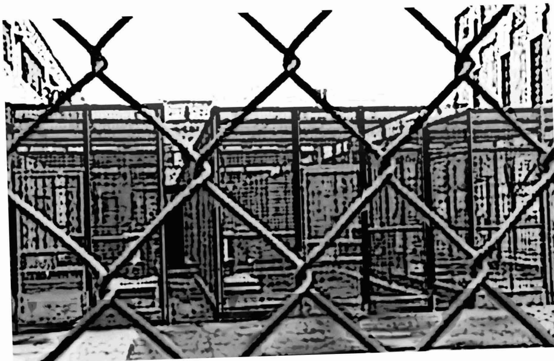
Exercise cages, San Quentin (Artist: Kendal Au)

The total number of people in long-term lock down in California on a given day exceeds 14,600