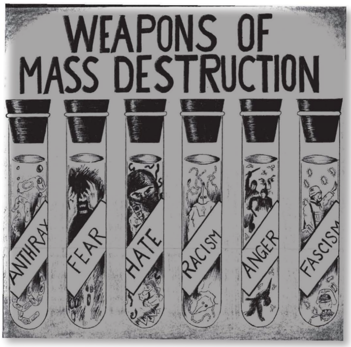
"Weapons of Mass Destruction" by Todd (Hyung-Rae) Tarselli

lifestyle. To linger in a bunk all day long only results in health problems such as irregular heartbeats, hypertension, depressed immune system, and atrophy of muscles which even I have been affected by after six years of isolation.