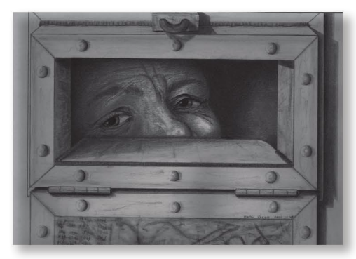
"Untitled" by Martin Vargas

up with prisoners who are locked up for being in some type of trouble so some people enjoy continuing that same behavior. Don't gossip or spread rumors as this will only keep you in constant conflict.