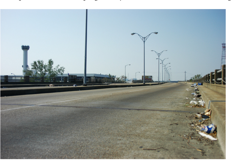
ABOVE: Broad Street bridge, where thousands of prisoners were left for days.

The first arrest and booking into Camp Greyhound is a story that corrections officers lauded in the media, but one that can and should be reconsidered as an early indication of how misguided the focus on law enforcement was. A man desperate to get out of New Orleans drove up in a stolen Enterprise rental car, hoping to buy a bus