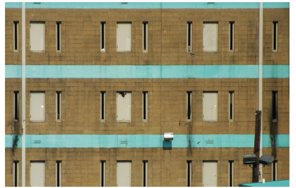
ABOVE: Burn marks on the side of Orleans Parish Prison from the sheets and blankets prisoners burned out their windows during Hurricane Katrina to receive help.

Orleans continued to do "police-sentencing time:" waiting as long as 45 days on a misdemeanor or as long as 60 days on a felony before the D.A. decided not to prosecute; <sup>54</sup> "DA time:" for those unable to post bond because of over-charging; and "Katrina time:" sitting in jail since being evacuated, even well beyond release dates. <sup>55</sup>