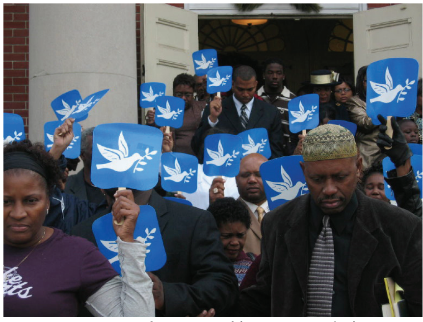
ABOVE: Supporters pour out of Waton Memorial during Amnesty Weekend.

44:9(F). On the other hand, when records are ordered to be destroyed, references thereto may not be made available to the public and must be kept under lock and