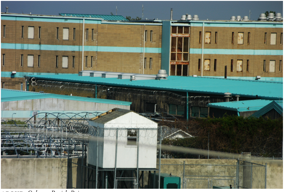
ABOVE: Orleans Parish Prison

Second and Third Periodic Report to the United Nations Human Rights Committee regarding compliance with the ICCPR and CAT, which stunningly failed to discuss the events surrounding Hurricane Katrina despite being submitted three months after the storm, a coalition of human rights advocates produced an exhaustive report documenting arrest practices and police brutality following Hurricane Katrina. The report, In the Shadows of the War on Terror: Persistent Police Brutality and Abuse in the United States, co-authored by members of Columbia Law School's Human Rights Clinic, INCITE! Women of Color Against Violence, and the American Friends Service