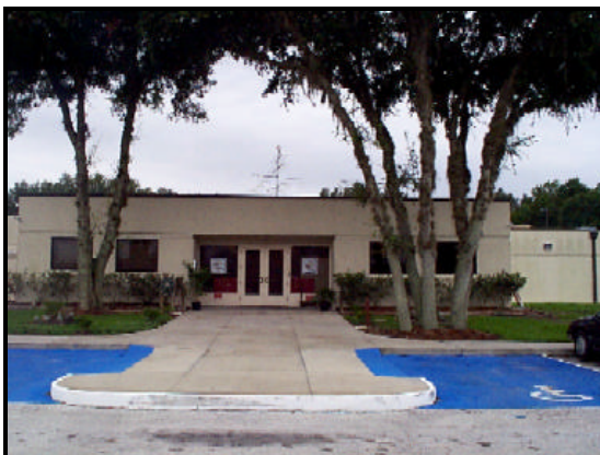
Pasco Regional Detention Center, Pasco County