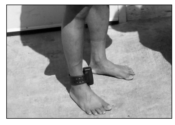
After 30 months in detention and nearly two years of compliance with the alternative program, this Sri Lankan asylum seeker still has to wear a large ankle bracelet.

Participants in these kinds of programs have very high "appearance rates" for their immigration court hearings—ranging from 93 percent to 99 percent.<sup>333</sup> While the average daily cost of detention is $95, the average daily cost for an alternatives to detention program falls between $10 and $14.<sup>334</sup> These kinds of programs—when used as true alternatives to detention for individuals who could not