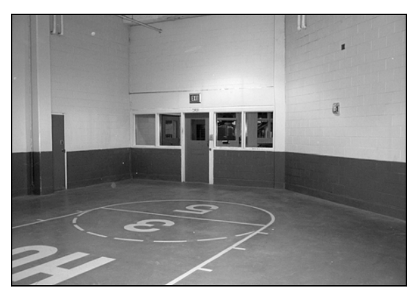
Many of the facilities lack meaningful outdoor space. This is the outdoor recreation area at the Hampton Roads Regional Jail in Virginia.

Lack of Privacy. In many of the detention centers and jails, asylum seekers have little or no privacy. Detainees are often housed in large "pods," or dormitories, some holding up to 100 people. At some facilities—like the Willacy, Pearsall, and Northwest detention centers, and the Piedmont county jail in Virginia-detainees sleep in narrow metal triple-bunk beds. (ICE has since stopped detaining asylum seekers and immigrants at the Piedmont jail; following the November 2008 death of an immigrant detainee who was held there, ICE transferred its detainees from the jail). In some of the facilities, bathroom and toilet areas are separated from the living, sleeping and eating area only by a low wall. Toilet and shower stalls often do not have doors. This is the case at the Willacy and Pearsall detention centers in Texas, the Northwest Detention Center in Washington, and the Elizabeth detention center in New Jersey. At the Northwest Detention Center, some of the toilets are reported to be located next to the dining area.<sup>79</sup>