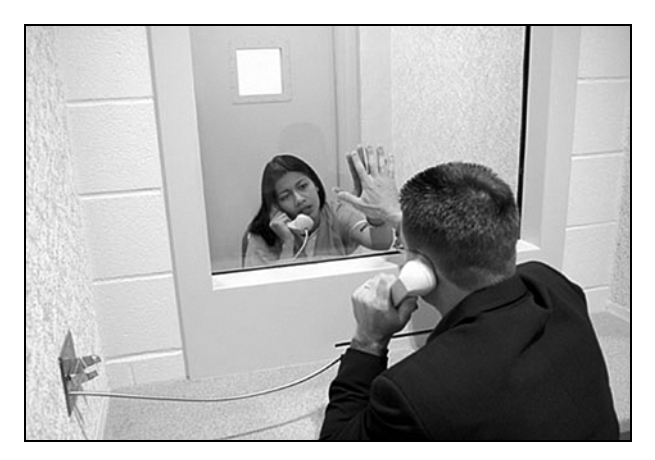
Many of the facilities do not allow detainees to have contact visits. Rather, detainees are only allowed to see their family and friends through plexi-glass.

Family Visits Through Partitions. Many of these facilities do not allow detainees to have contact visits with family or friends. At the Elizabeth Detention Center in New Jersey-a facility that exclusively holds non-criminal detaineesdetainees are only allowed to see their family members and friends through a thick sheet of glass, and can only speak to them through a phone. The Pearsall Detention Center, a 1,904-bed facility located in a sparsely populated area one hour from San Antonio, holds hundreds of asylum seekers from all over the world on any given day.85 Family and friends—who are likely to have traveled a great distance—are only allowed to visit their loved ones through a glass partition. None of the ICE-run and contract detention facilities allow for contact visits with family or friends, with the exception of the Broward Transitional Center.86 Facilities where contact visits with family and friends are not allowed include: the Florence Service Processing Center in Florence, Arizona; the Hampton Roads Regional Jail in Hanover, Virginia; the Krome Service Processing Center in Miami, Florida; the Northwest Detention Center in Tacoma, Washington; the Varick Street Federal Detention Facility in New York; and the Willacy Detention Center in Raymondville, Texas.