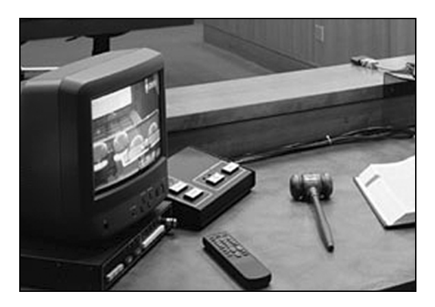
At some of the remote detention centers, asylum seekers often see U.S. immigration judges only on television sets.

When visiting both the 1,904-bed Pearsall facility and the now 3,000-bed Willacy facility, Human Rights First's delegation saw courtrooms that were centered around television sets, rather than live immigration judges. From our meetings with local immigration officials, pro bono attorneys and asylum seekers, Human Rights First learned that—during these video hearings—the asylum seeker may end up sitting essentially alone in the courtroom in front of the television set, or in some cases next to the government's trial attorney, while the judge sits in a courtroom at another location. If the asylum seeker is represented, his or her attorney must choose whether to sit next to the asylum seeker or whether to appear in person before the judge. One federal appeals court called this kind of choice a "Catch 22"—requiring an attorney to decide between the ability to confer with a client during a hearing and the opportunity to "interact effectively" with the judge and opposing counsel.314