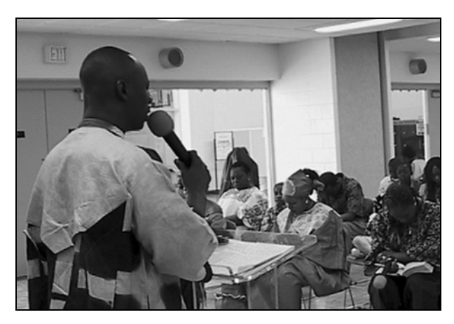
A Pastor from Liberia was detained for three and a half months in a New Jersey immigration jail. He was denied parole and was only released after a U.S. immigration court granted him asylum.