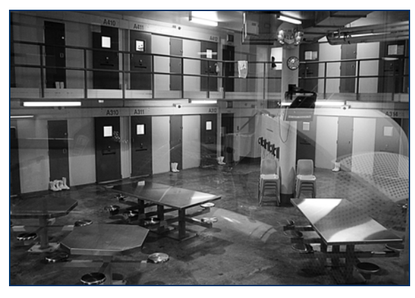
While detention averages $95 per day, alternatives to detention range from $10 to $14 a day; and release through parole has no financial cost each day.

Since 2005, ICE has increased the number of "beds" it uses to detain immigrants by 78 percent.<sup>237</sup> In the past four years, Congress has doubled the annual budget for ICE detention and removal operations to a current budget of $2.4 billion. Nearly 70 percent—or $1.7 billion—is devoted to "custody operations."<sup>238</sup> In fiscal year 2007 alone, ICE detained over 310,000 asylum seekers and immigrants,<sup>239</sup> and in fiscal year 2009, ICE planned to detain over 440,000.<sup>240</sup>