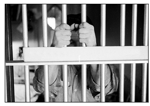
The psychological health of detained asylum seekers worsens the longer they remain in detention.

Numerous other studies have also confirmed that detention has a negative and sometimes lasting impact on the mental health of asylum seekers.<sup>219</sup> For example, a 2006 study on the effects of detention on asylum seekers in Australia concluded that "prolonged detention exerts a long-term impact on the psychological well-being of refugees." The study also documented that the negative mental health effects of detention on asylum seekers "persist for a prolonged period after detention." <sup>220</sup>