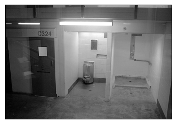
In many of the detention centers and jails, asylum seekers and other immigrant detainees have little or no privacy.

fiscal year 2003 through fiscal year 2007, with the most growth occurring since 2005.61