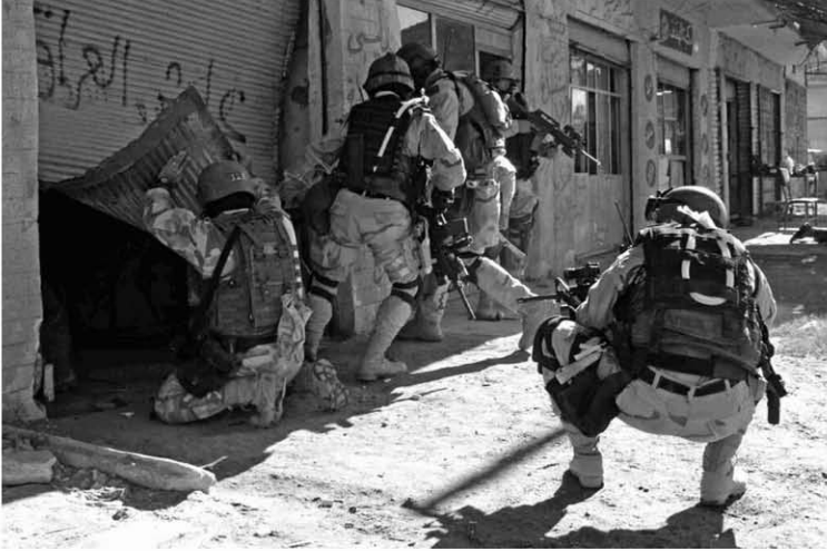
Figure 3. SOF conducts dynamic entry in search of high-value target in Iraq.

apparent, but in ways unanticipated. It was the SOF involvement in the legal aspects of mission execution followed by criminal prosecution that was totally unexpected. In most incidents, they were serving as advisors to Iraqi officials who were technically in command of the operations. Still, the SOF personnel found themselves integrally involved in the Iraqi legal system.