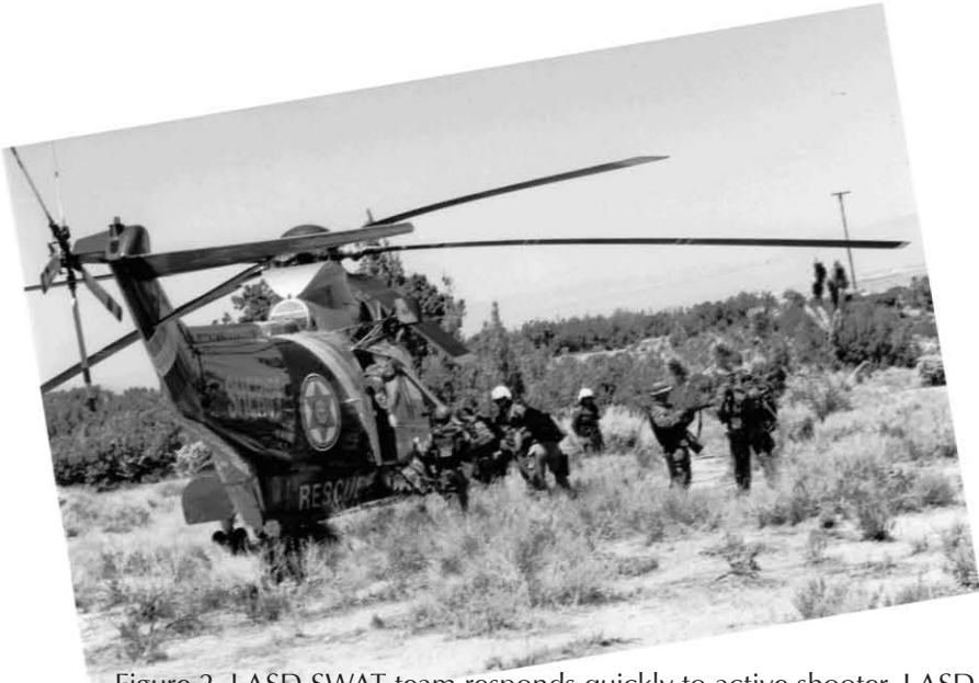
Figure 2. LASD SWAT team responds quickly to active shooter.

it is important to engage the shooter as rapidly as possible. As on combat missions, it may be necessary to bypass wounded victims in order to minimize casualties of innocent bystanders. This consideration represents a substantial change in thinking for law enforcement and is an example of the convergence of the operations. Because of the LEA experiences with multiple shooters and substantial numbers of casualties, the need for area security now preempts immediate care for victims.