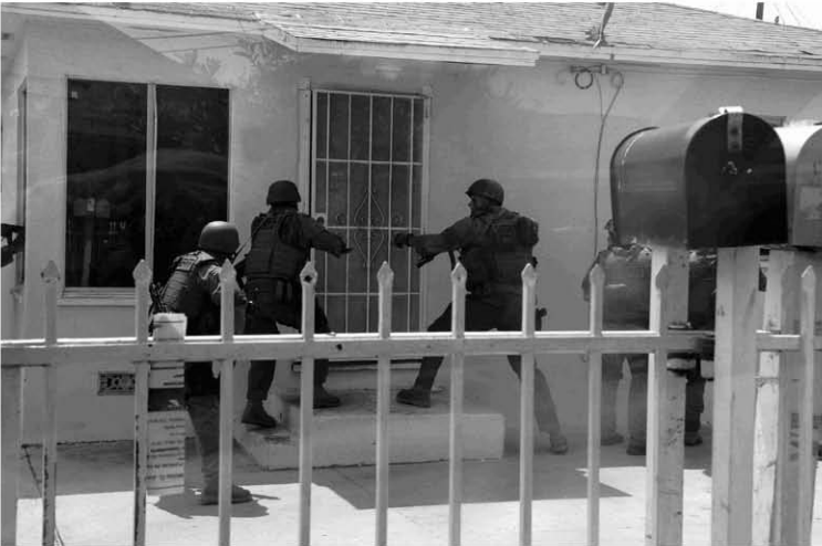
Figure 4. LASD SWAT practicing dynamic entry for service of high-risk warrants.