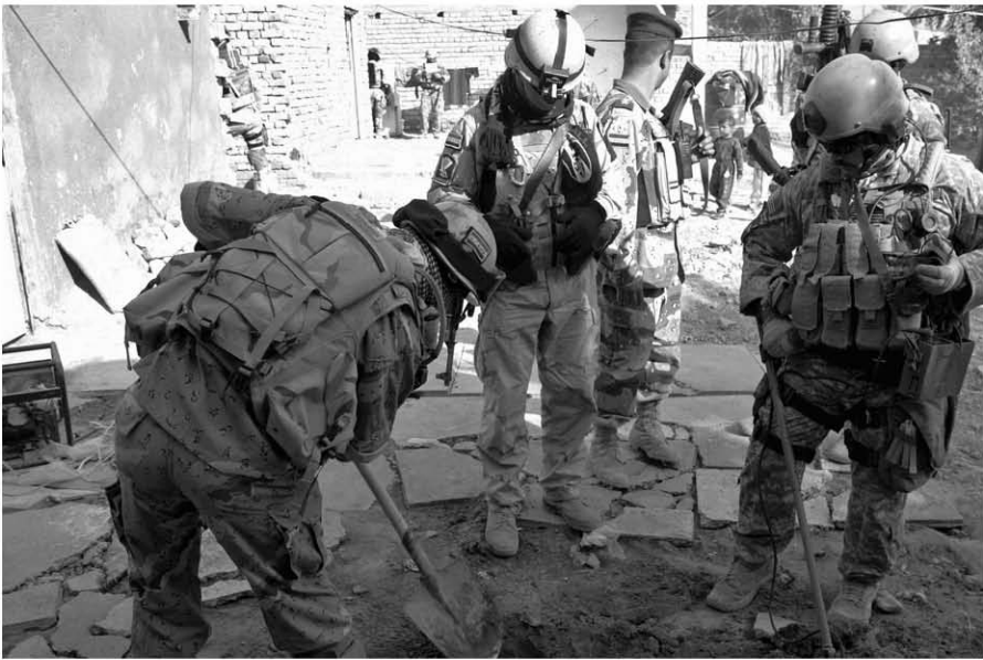
Figure 5. SOF with Iraqi counterparts search for evidence following explosion of an IED.

Television programs portray specialized forensic units indigenous to major LEAs that engage exclusively in collecting evidence and scientific sleuthing. Reality is a bit different. At all stages in their career, starting from the academy, officers learn how to isolate and protect evidence at a crime scene. Crime scene specialists then follow up, often under relatively controlled circumstances. Collection of evidence on the battlefield usually is more difficult. While specialists are available on some occasions, most often it will be SOF personnel engaged in the collection. For instance, teams have been sent in to attempt to confirm the identities of high-value targets who have been attacked and killed by bombs or rockets.