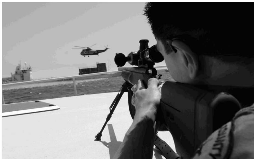
Figure 10. LASD sniper engaged in counterterrorism training exercise involving protection of shipping.

In many situations the sniper is employed to save lives. While that might sound counterintuitive, in both SOF and law enforcement, the sniper is often used to protect others. SWAT units resort to use of deadly force as a last resort. Unfortunately, movies and television have contributed quite negatively and produce an image of trigger-happy marksmen. The reality is far different; it is only in rare instances that SWAT snipers actually