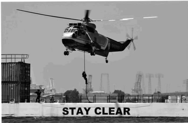
Figure 13. LASD SWAT team member executing a fast rope insertion onto a ship in a counterterrorism exercise.

Whether all areas of the country will have adequate response capability remains to be seen. Mentioned was the expense associated with developing and maintaining specialized units. National-level funding to accomplish that task could be provided, even though we are in a zero-sum environment when it comes to spending. While regional cooperation is improving, much more could be done. For local jurisdictions, having specialized units on a full-time basis is resource constrained based on the current tax situation. For departments in large metropolitan areas, maintaining SWAT teams is