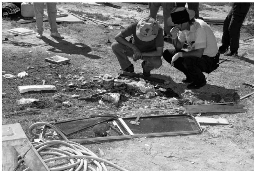
Figure 6. Crime scene investigators search for evidence in a bombing that killed a federal witness in Las Vegas.

When IEDs are encountered, even after boom , minute details remain and individuals have been identified from the scraps of evidence collected. Thousands of latent fingerprints have been taken off of bomb components such as circuit boards, batteries, and remote control devices. 85 Much of the forensic investigation is conducted by FBI scientists with whom many USSOCOM units have been collaborating for the past few years. 86 What seems certain is that SOF personnel will continue to be involved in obtaining and protecting vital evidence. Defensive issues are also to be addressed so that forensic science does not threaten the identity of SOF operators. Both sides of this coin lead to the conclusion that more intensive training is dictated.