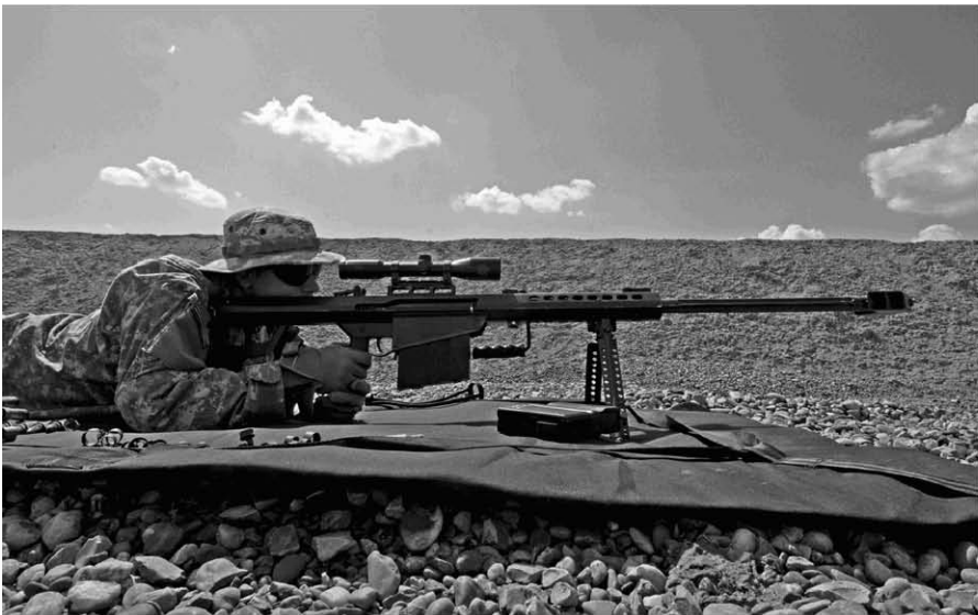
Figure 9. SOF sniper training in desert environment.

One aid in dealing with cross-jurisdictional manhunts is that sheriff's deputies also can be sworn as U.S. Marshals. This capability may allow the suspect to be arrested by officials from the original jurisdiction of the crime and expedite extradition. International cases are considerably more difficult. Even if the suspect's whereabouts is known, the time and expense required for international extradition makes such processes reserved for only the most egregious crimes. 153