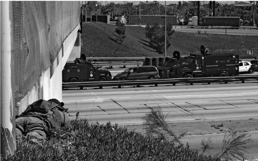
Figure 7. SWAT sniper in overwatch as team members take down a suspect in a vehicle on a Los Angeles freeway.

Given their career in an LEA, they get to know individuals and develop networks that can support their activities. Most major metropolitan areas employ the program known as COPS. Those Community-Oriented Policing programs assure that officers are assigned to a specific small geographic area. It is designed to have officers know the community leaders and businessmen. Ideally, they actively participate in local activities, work to gain the trust of the population, and listen to their problems and concerns. 131 It was found that fixing small problems and grievances greatly reduced larger ones. Again, the LEAs have the home court advantage.