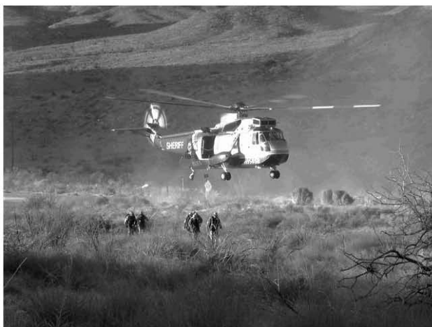
Figure 1. Los Angeles Sheriff's Department SWAT team members training for small-unit tactics in the Mojave Desert.

Local and international gangs have precipitated a level of violence in some precincts that is unparalleled in our nation's history, even dating to the notorious crime syndicates of the early 20th century. The response by many LEAs has been to organize and train specialized units, commonly called SWAT teams, which often have capabilities to perform operations that bear striking resemblance to small unit military operations.