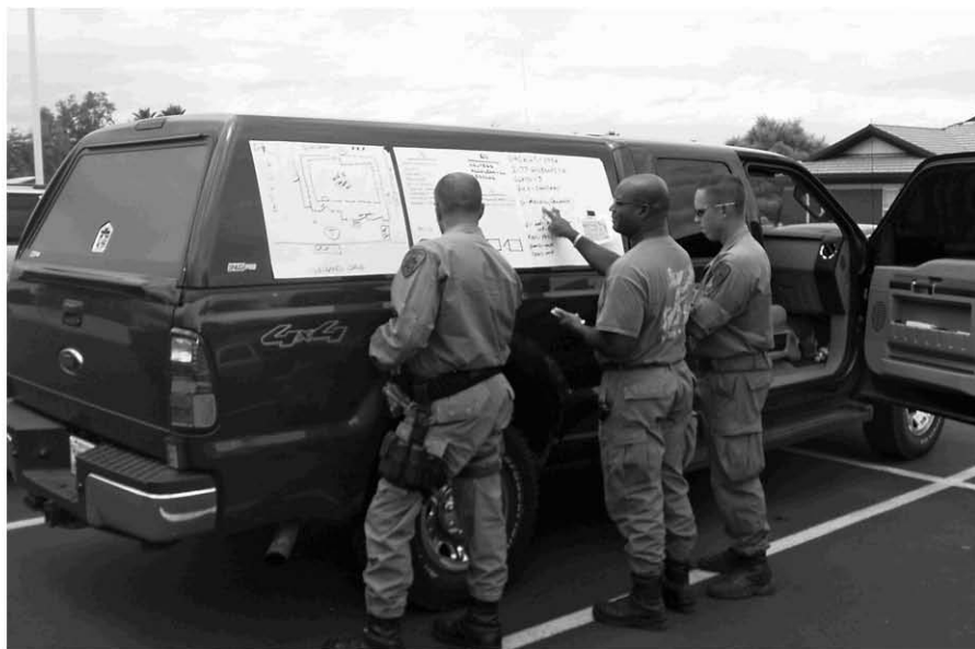
Figure 8. Las Vegas SWAT team prepares to execute a high-risk warrant. Every team member is briefed on assignments and confirms equipment to be carried.

The planning process is repeated in great detail, even when the unit is executing several warrants in a single day. Like with military missions, while operations may be similar, no two are identical. 143