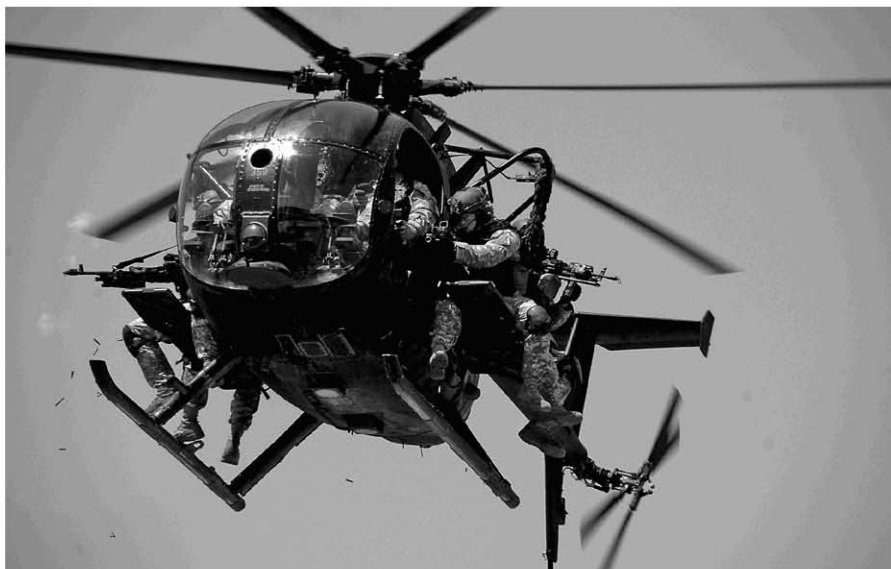
Figure 12. SOF engaged in counterterrorism operation approaching the target.

Threats posed by international terrorists are of major concern to national LEAs that function primarily under the jurisdiction of the Department of Justice. Recognizing that they constitute only about 5 percent of the law enforcement personnel in the U.S., they are now engaging with state and local officials as never before. Area fusion centers have sprung up across the country, and information sharing is improving—but has a long way to go. As noted in The 9/11 Commission Report , interagency cooperation was severely lacking prior to that attack. Constant attention and improvement is