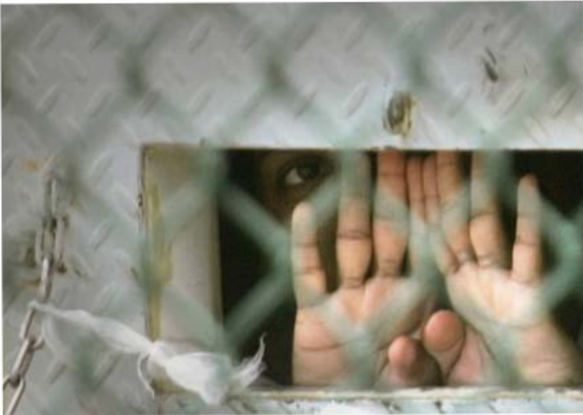
Dec. 4, 2006 A detainee peers through a hole used to pass food into cells at Camp Delta at Guantánamo.