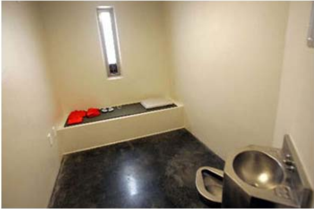
A cell for a noncompliant detainee is pictured inside the prison at Camp 5 in the Guantánamo Bay US Naval Base, June 26, 2006.