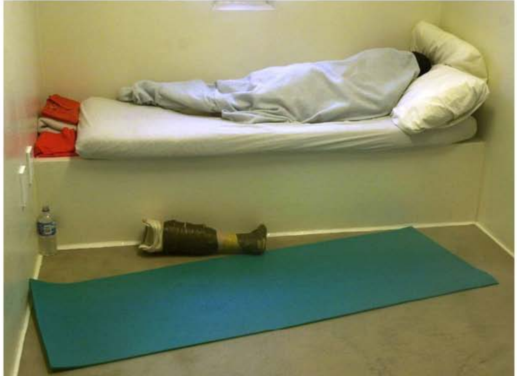
June 30, 2004 A detainee, his prosthetic leg on the floor below him, sleeps inside his cell at Camp Five, the maximum-security detention and interrogation facility at Guantanamo.

appendix, separate from general provisions that address interrogation techniques, which allows isolation to be used for interrogation purposes. 104 Appendix M of the AFM permits the use of “separation” as a “restricted interrogation technique” with the purpose of gaining “actionable intelligence in the war on terrorism.” 105 Under Appendix M, a detainee can be subject to physical separation for up to 30 days, with extensions permitted. 106 Moreover, Appendix M suggests that a detainee could be subject to several