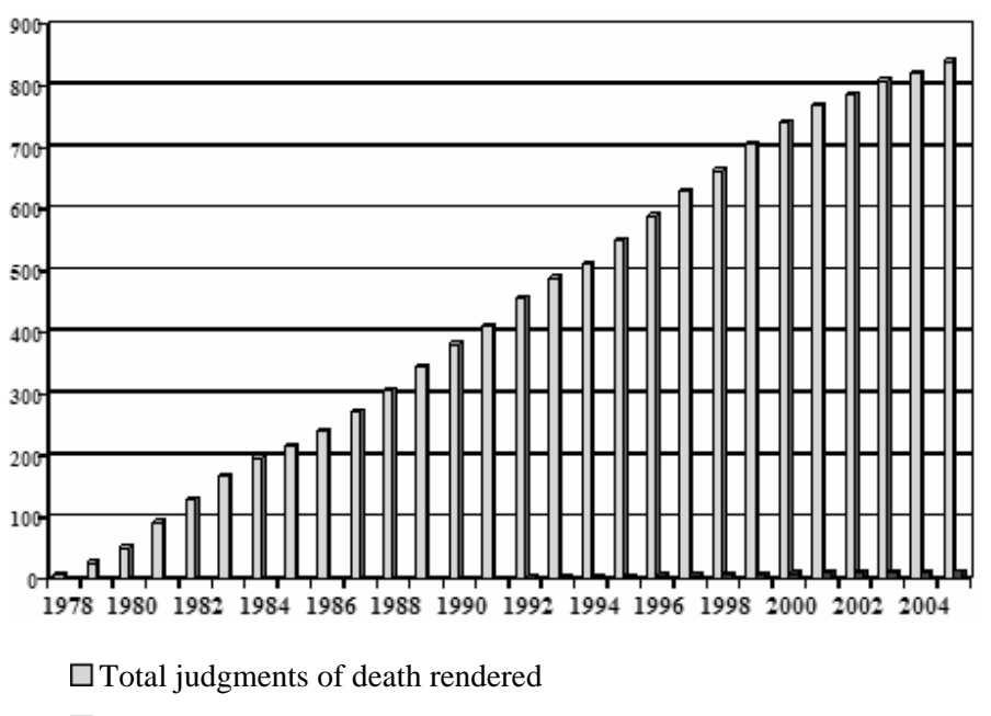
FIGURE 1: Judgments of death rendered v. Executions carried out in California 1978–2005