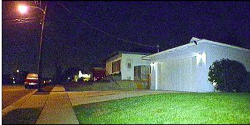
Mark Leimbach / NBC 7/39