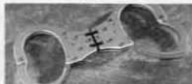
The A-550 Ultralite® Hinged Handcuff