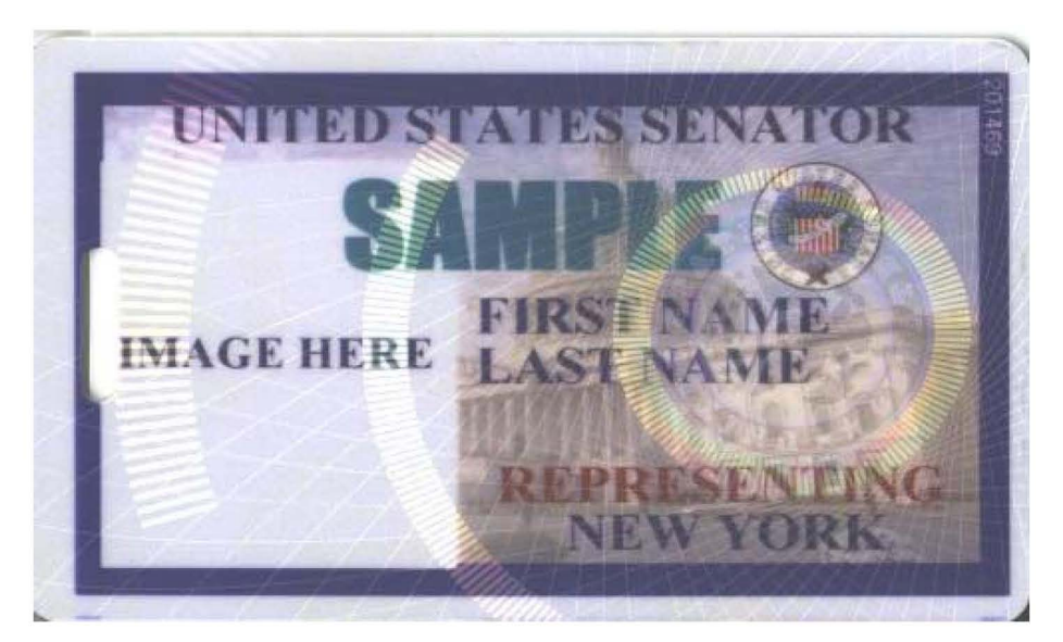
United States Senator ID Card