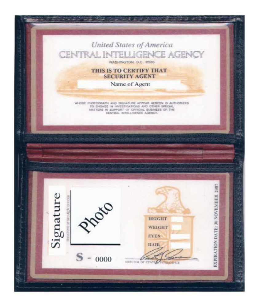
Sample CIA WOMAP Credential (Red or Blue Border)