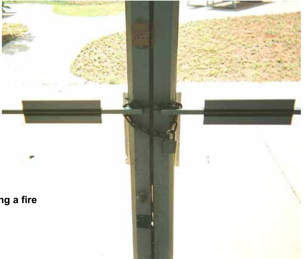
Exit doors padlocked creating a fire hazard