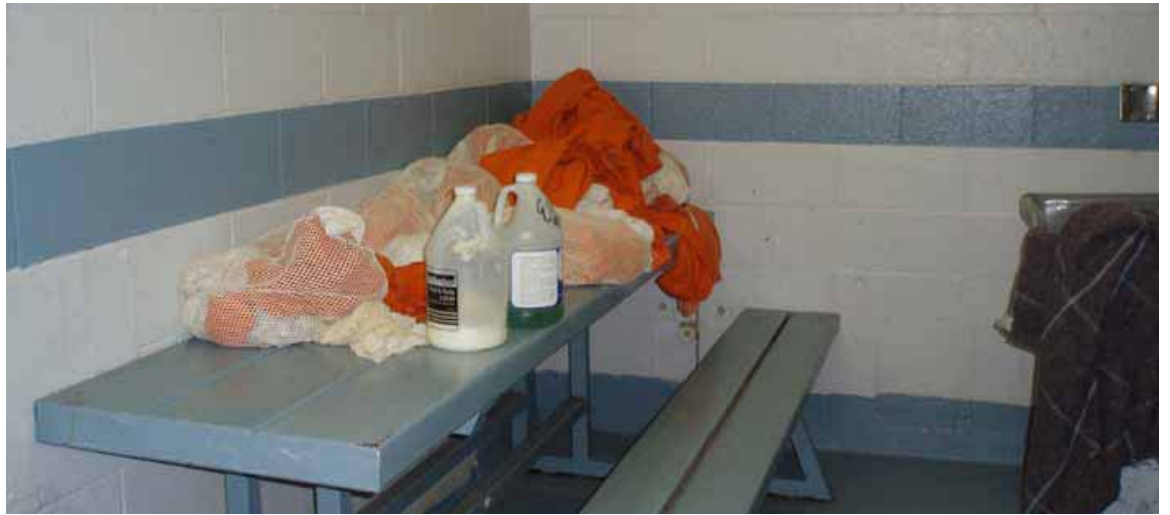
Unsecured chemicals, tools, and supplies in various locations