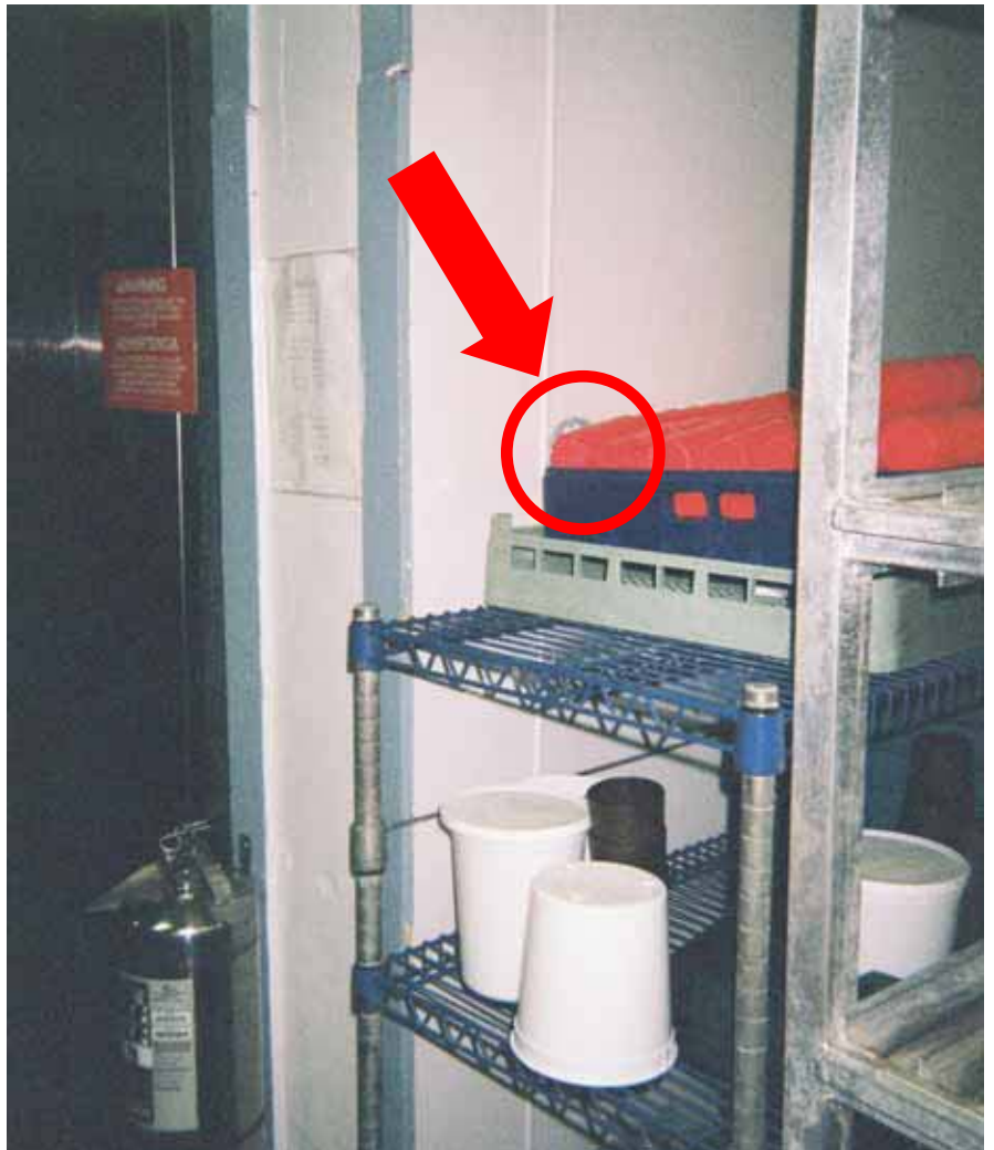
Emergency pull station for fire suppression system in kitchen blocked