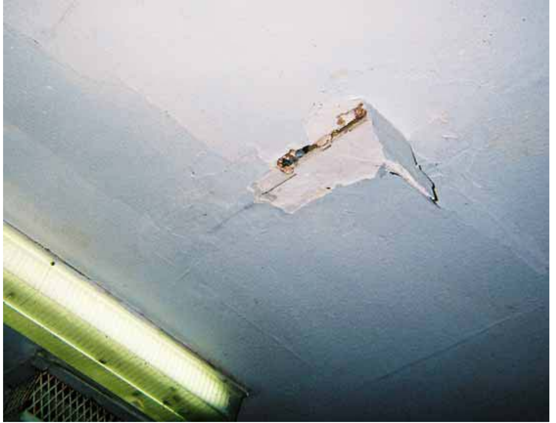
Ceiling in disrepair (above)