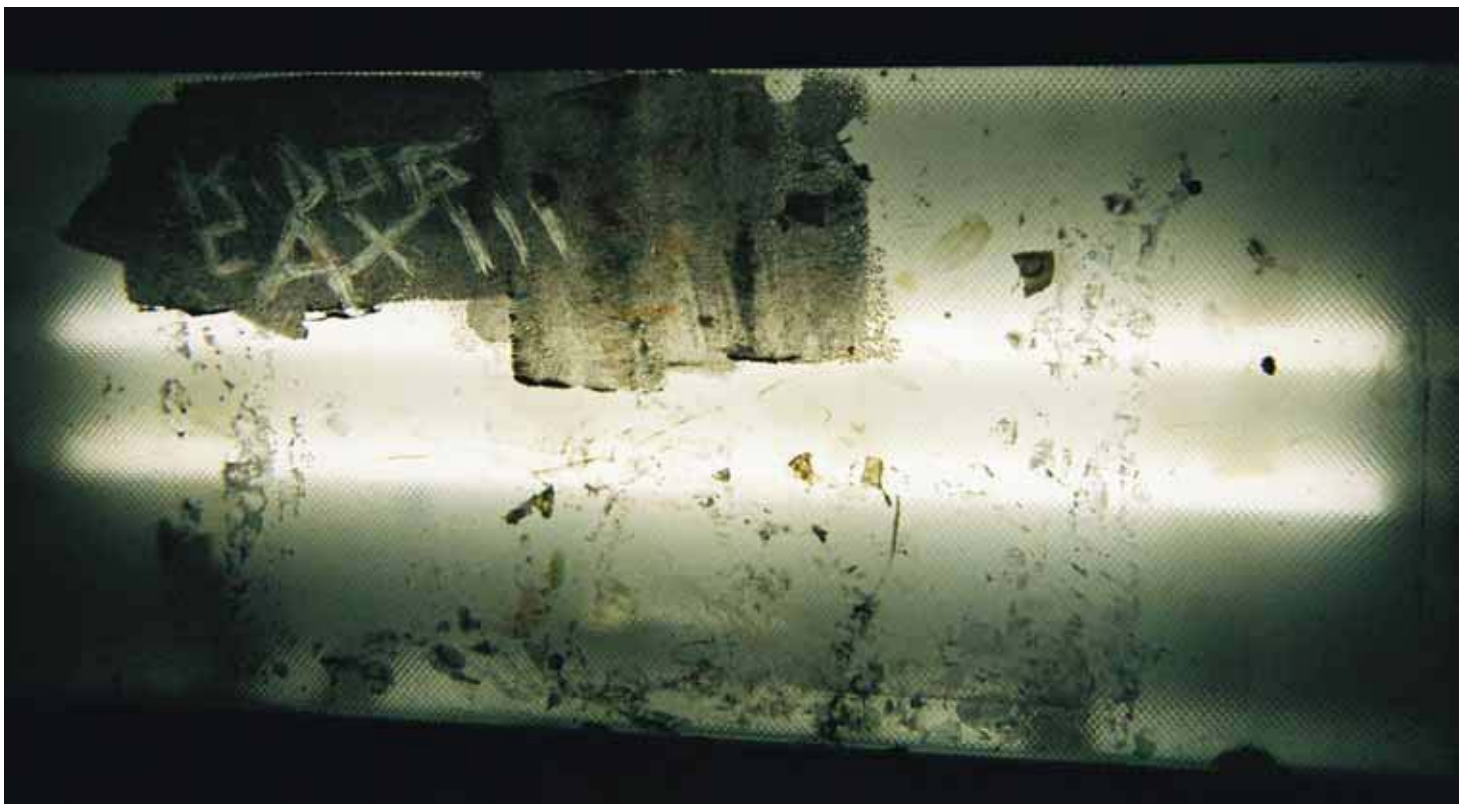
Gang tagging, dead insects, possible smeared feces in light fixture (below)