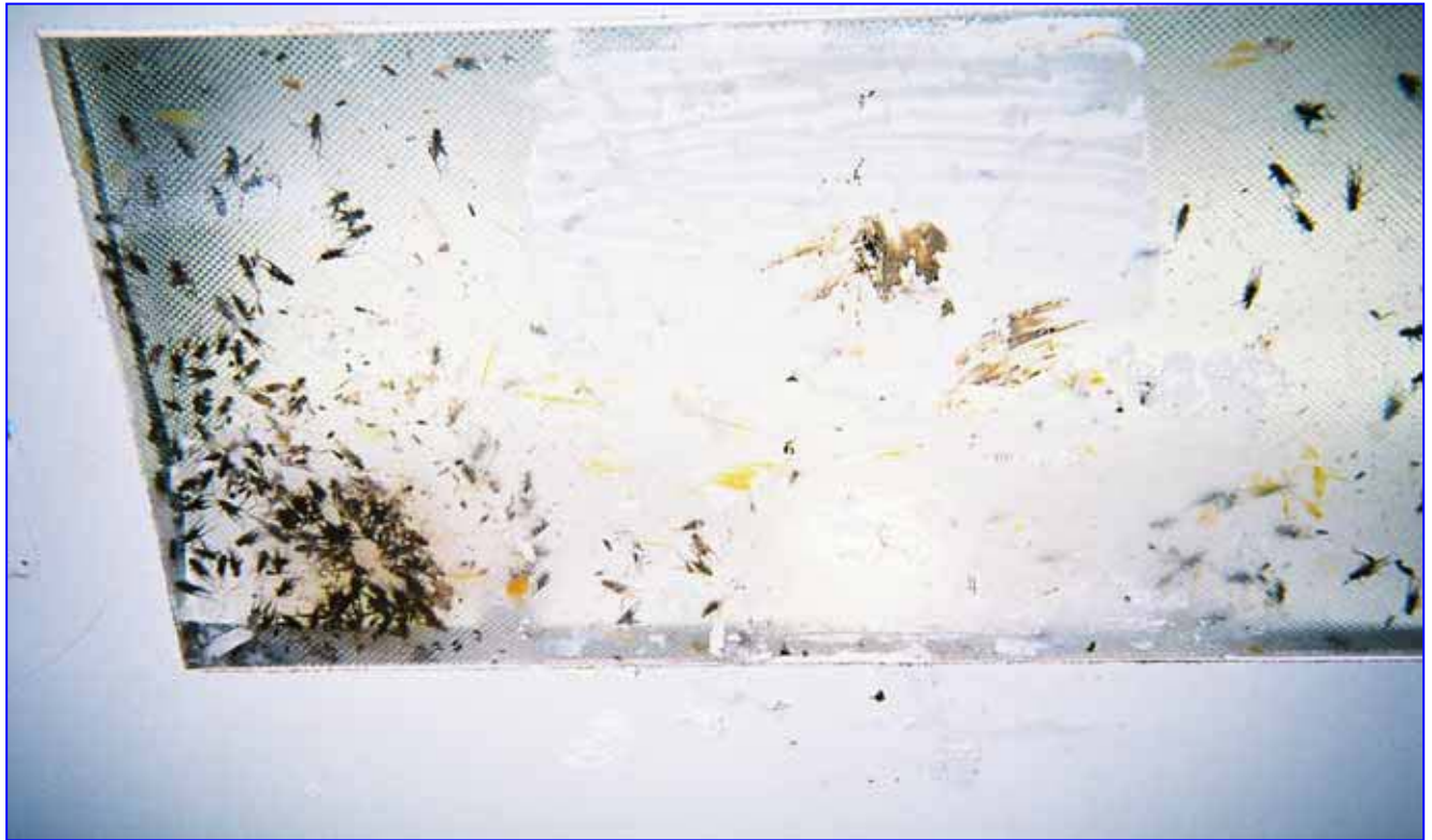
Dead insects trapped in light fixtures (above)