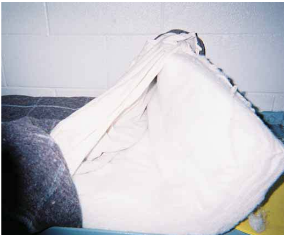
Clogged lint-trap under the only operational dryer on campus (for nearly 200 youth) creating another fire hazard