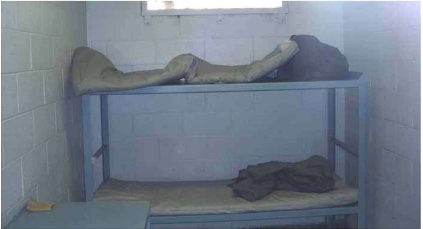
Youth sleeping area showing holes in mattresses and no sheets