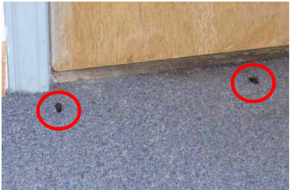
Insect infestation throughout the facility. Dead insects (indicated in red circles) pictured here: conference room door (above), youth shower area (middle), infirmary (below)