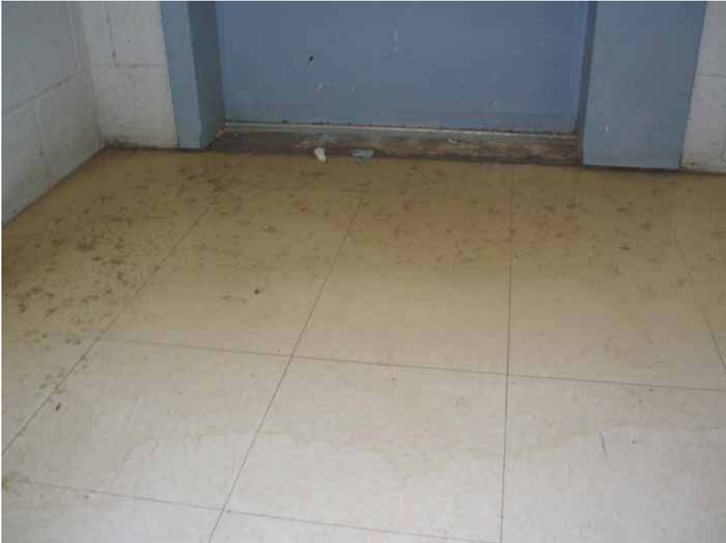
Water stains and puddle in floor