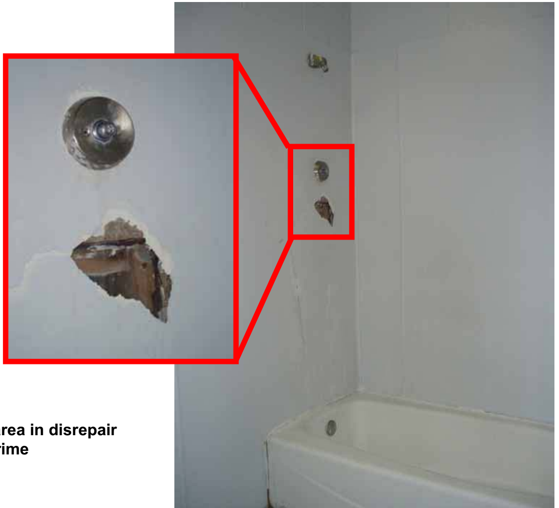
Shower and tub area in disrepair and covered in grime