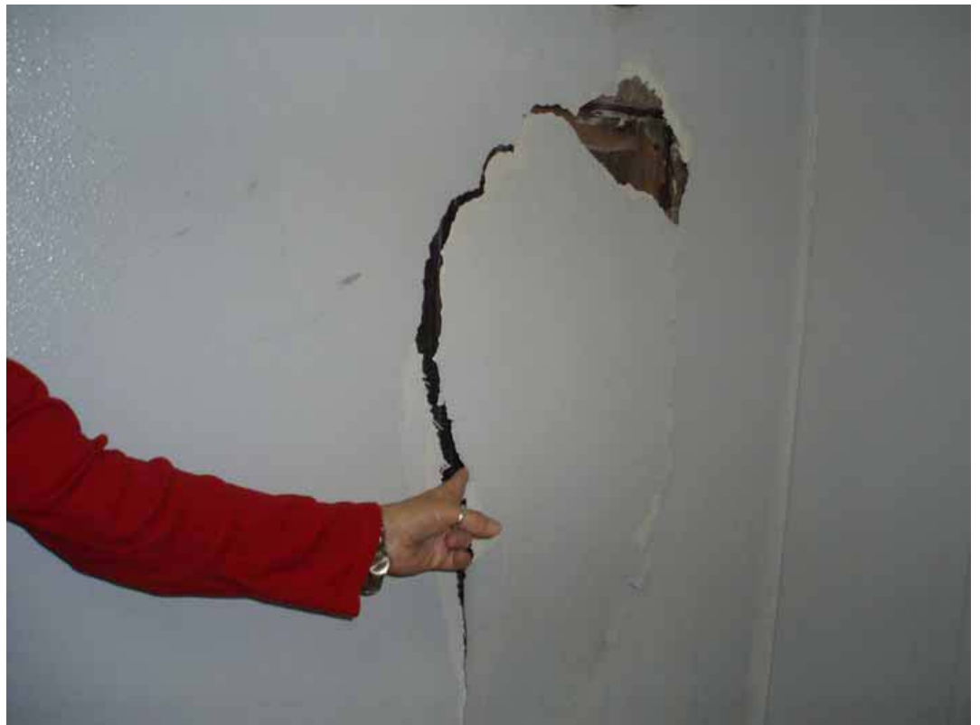
Wall in disrepair (below)