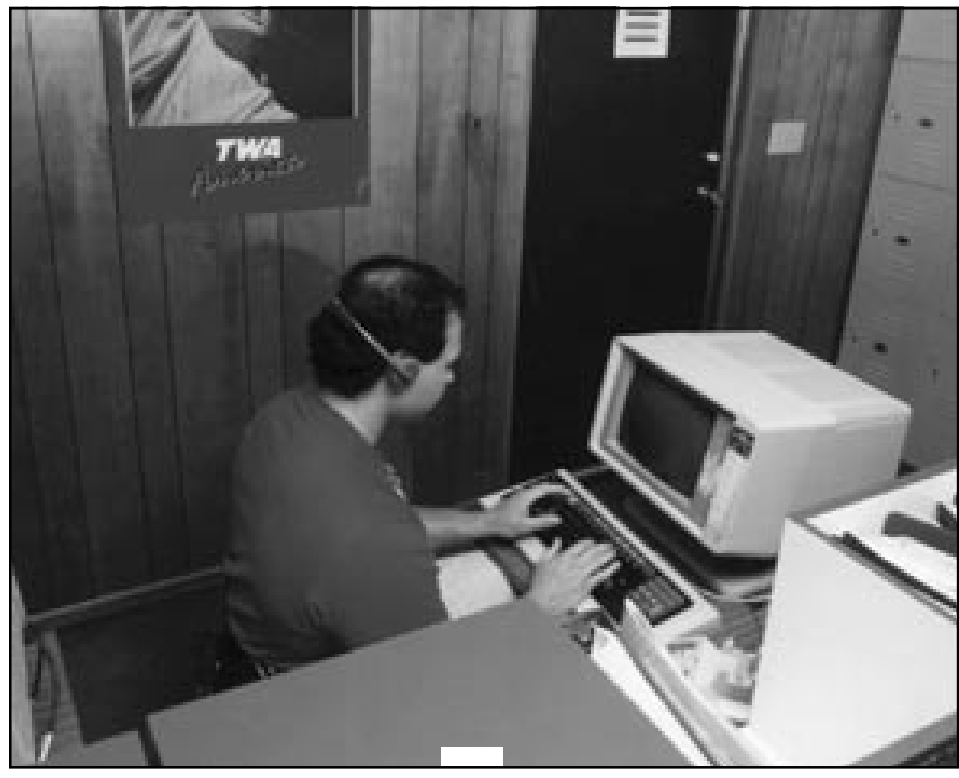
An inmate at the California Youth Authority's Ventura Training School, where inmates schedule all of TWA's around-the-world itineraries, talks with a customer about a European vacation.

We've found that a number of specialized desks performing functions like round-the-world itineraries are harder to staff in larger work environments. Here, at Ventura, once we've trained an agent in this kind of specialized service we know that he is