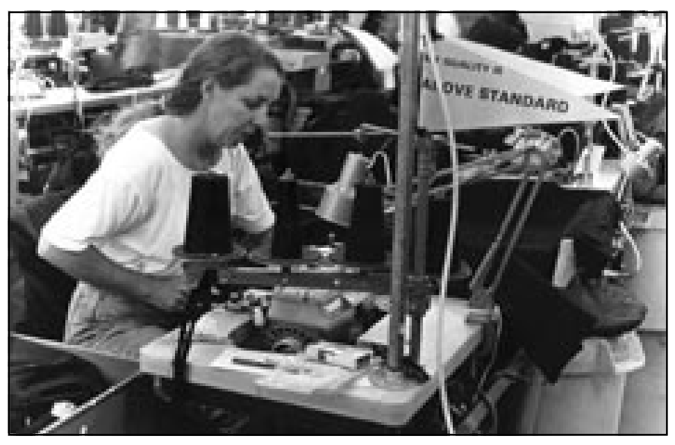
An inmate employed by Jostens, Inc., at the Laurens Correctional Facility in South Carolina, sews a graduation gown for a major university.

Prisons are not trouble-free work environments. Escod has had to work closely with correctional officials at Evans to overcome a number of problems, especially absenteeism and turnover. Absenteeism on the shop floor during Escod's first year of operations disrupted the company's work teams and increased overtime costs. Escod reduced unexcused